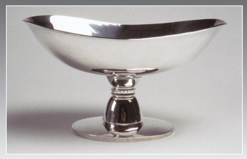
Fig. 5. Sterling tazza, circa 1950.