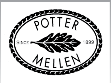
Fig. 4. Potter and Mellen hallmark.

suggestive of crouching beings stalking their prey.