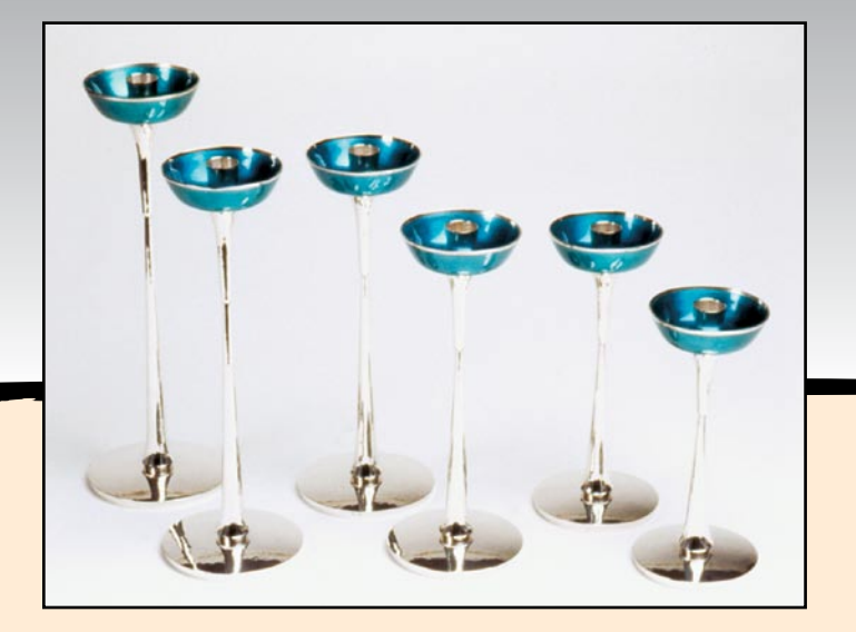
Fig. 8. Sterling and enamel candlesticks, 1964.

in 23 karat gold, several of which were included in his one-person show at the Henry Art Gallery on the University of Washington campus in Seattle in 1968. In tune with the design of the time, these bottles evolved beyond the free forms and asymmetry of the 1950s toward the looseness and eccentricity that would soon be a hallmark of the new crafts movement of the late 1960s. Their irregular bodies and undulating necks belied the technical precision required for their creation.<sup>18</sup>