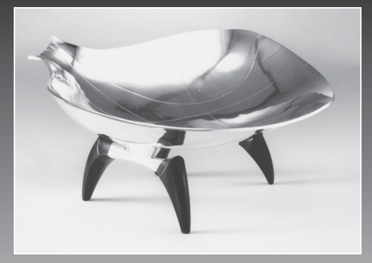
Fig. 6. Sterling and ebony bowl, circa 1950.